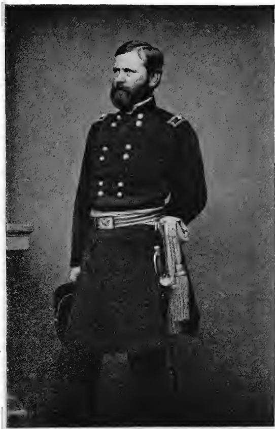
GENERAL W. B. FRANKLIN